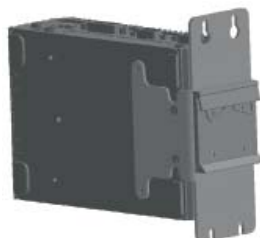
Side Mount DIN-Rail